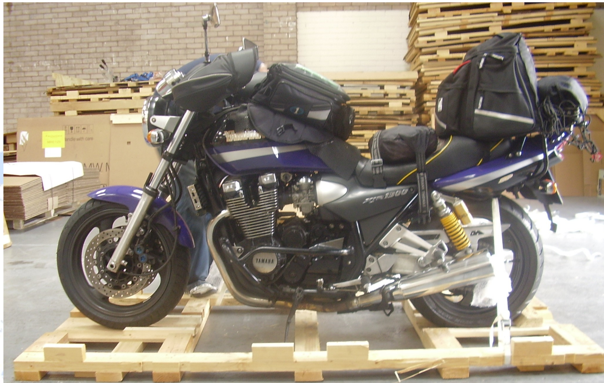
Packed up – Ready to Roll